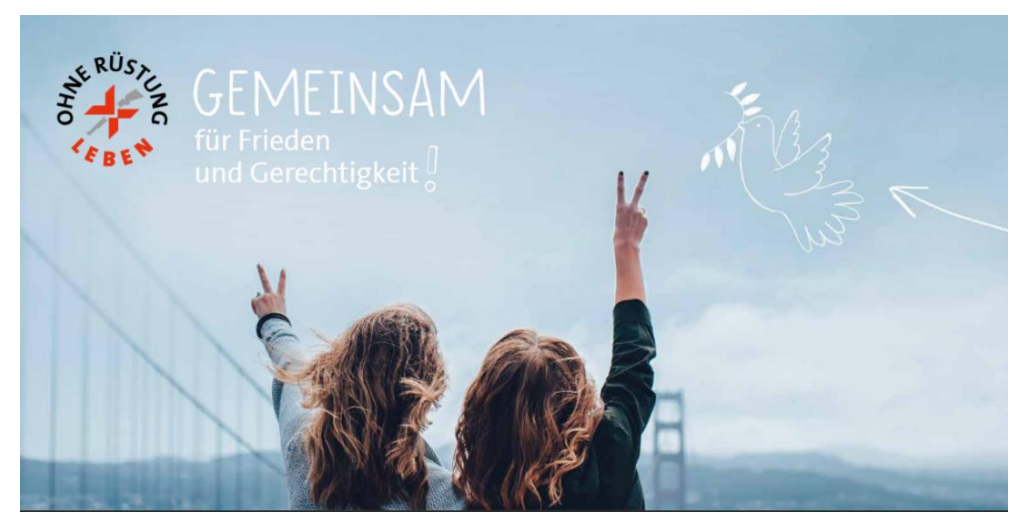
Stopping arms exports